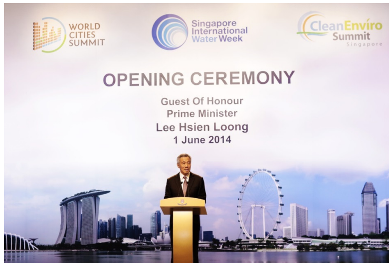
Prime Minister of Singapore, Lee Hsien Loong, opens the World Cities Summit, Singapore International Water Week and CleanEnviro Summit Singapore 2014