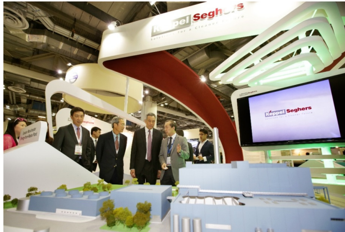
PM Lee visits Keppel's Greater Manchester Energy from Waste Plant booth at WasteMET Asia during CleanEnviro Summit Singapore 2014