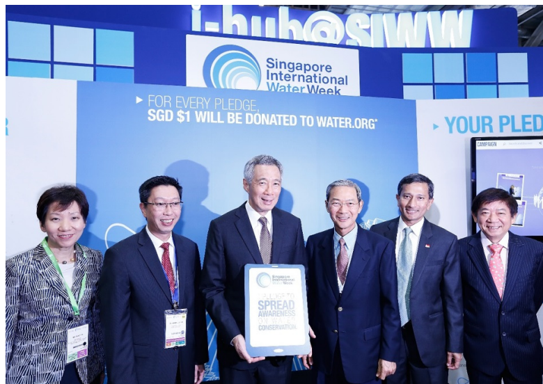
The Singapore International Water Week (SIWW) 2014 debuts #SIWWPledge, an innovative corporate social responsibility campaign to rally the global community towards the water cause.